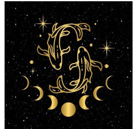
Pisces – February 1 - - March 20

At its core, our branch is about connection, purpose, and community. Our revision mission statement adopted by the BEC below captures the spirit of who we are and what we strive to provide for every member.