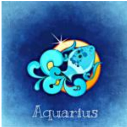
Aquarius – Jan 20 – February 18