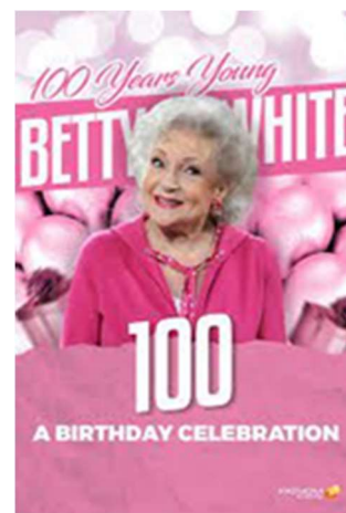
Betty White Day January 17