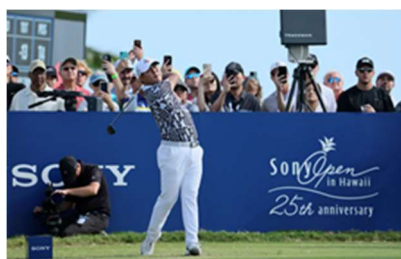
Sony Open in Hawaii January 8 - 14