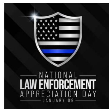
National Law Enforcement Appreciation Day January 9