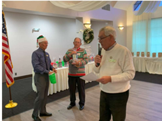
Master and Elves