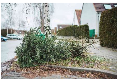
National Take Down the Christmas Day January 6