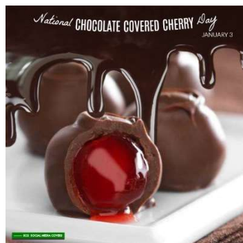
National Chocolate Cherry Day January 3