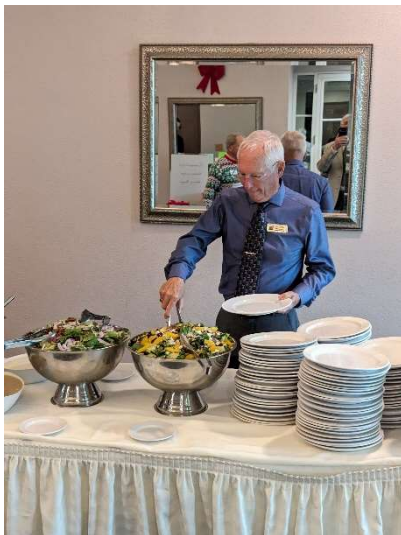
First One in Line